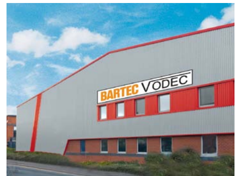
BARTEC VODEC in Nottingham, United Kingdom