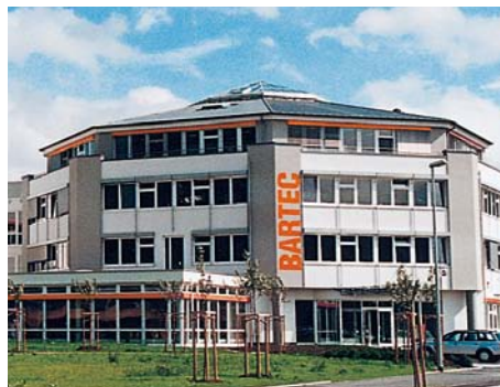
Head office of BARTEC in Bad Mergentheim, Germany

Our regional specialist teams, over 30 operating entities and more than 50 specialist representatives bring BARTEC expertise to you, wherever you are.